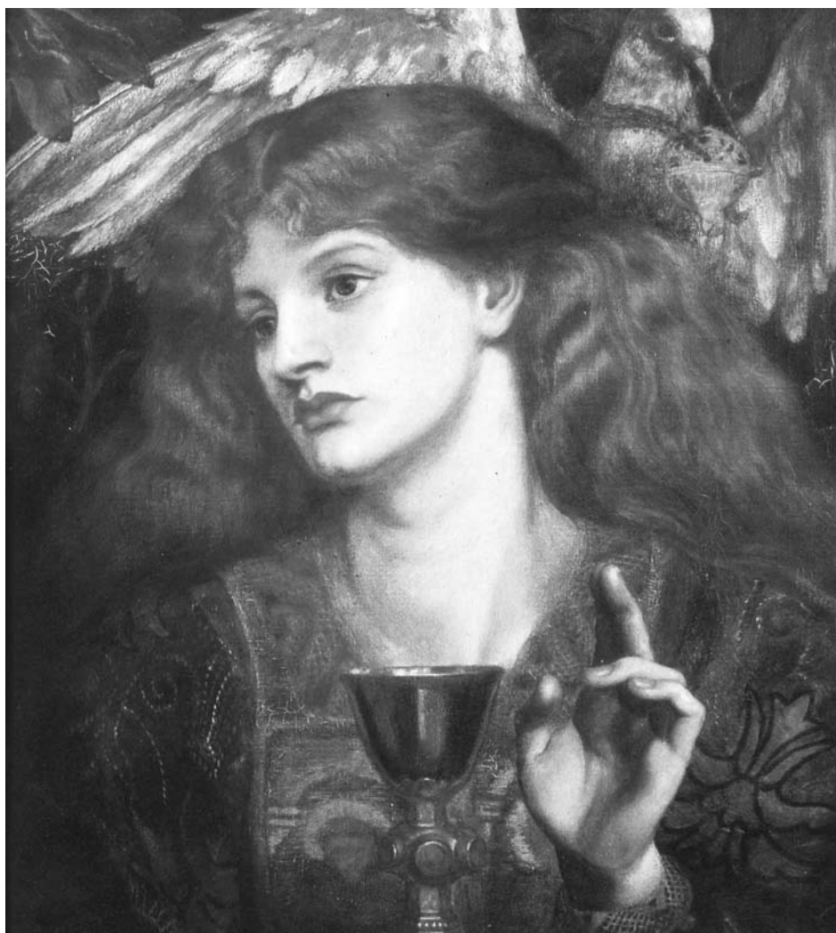
The Holy Grail by Dante Gabriel Rossetti

Yet many Christians also believed that Magdalene was a royal descendant of the Tribe of Benjamin, and that she and Jesus enjoyed an intimate relationship, possibly even marriage. In fact, this key female figure in theology may have been pivotal to the fact that Christianity developed at all,