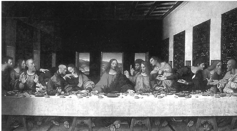
Many think Mary Magdalene sits to the left of Jesus in DaVinci's Last Supper.

"For the man is not of the woman, but the woman of the man," we are informed in the first Corinthians, 11:3,7,9. "Let the women keep silence in the churches, for it is not permitted unto them to speak, but they are commanded to be under obedience, so saith the law. And if they learn anything, let