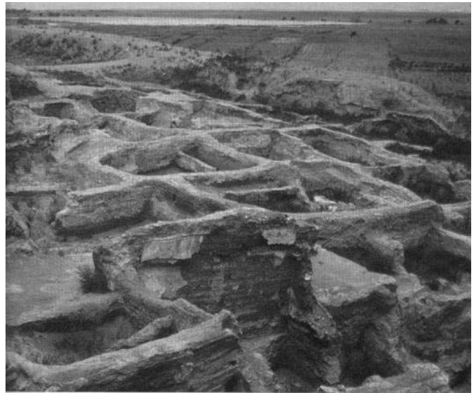
Neolithic ruins at Catalhuyuk, in Turkey.

Stone writes, "Most of the information and artifacts concerning the vast female religion, which flourished for thousands of years before the advent of Judaism, Christianity and the Classical Age of Greece, have been dug out of the ground only to be reburied in obscure archaeological texts, carefully shelved away in the exclusively protected stacks of univer-