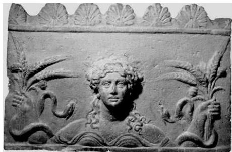
The Greek goddess Demeter.

Magdalene and several other women associated with Jesus were known to belong to wealthy families, and probably used their not unsubstantial resources to fund the spread of the new religion, since neither Jesus, who worked as a carpenter, nor his male disciples possessed that kind of cash.